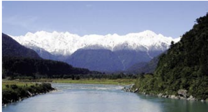
WHATAROA RIVER (A)

Here, a glacier-fed river (A) on the West Coast of the South Island contrasts with a mountain-fed braided river (B) on the Canterbury Plains of the East Coast. Both of these South Island rivers begin in high elevation areas, contrast this with the low elevation warm climate waterway of the North Island, shown in photo (C).