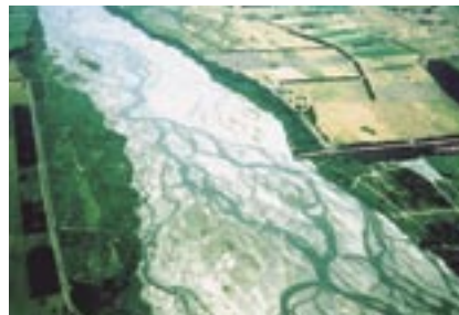
WAIMAKARIRI RIVER (B)