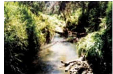
TRIBUTARY OF THE MOKAU RIVER (C)